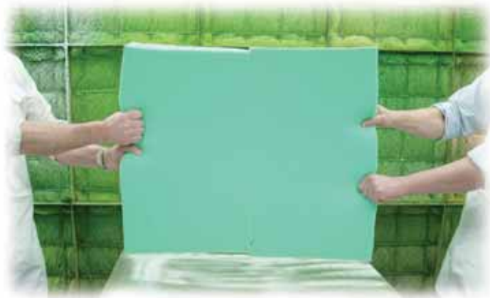
Two pieces of foam joined with the SABA Foam Bonding Solution

Furthermore, our team of chemists is in constant pursuit of the next break through in water based foam bonding adhesives and achieved this objective via the development of the SABA Superspray series.