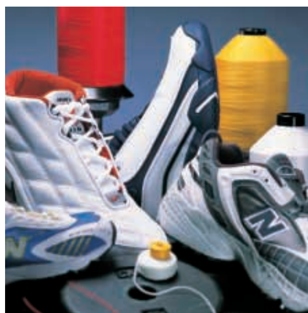
Technical Data - COATS aptan

Unbonded, twisted, continuous filament nylon 6,6 thread